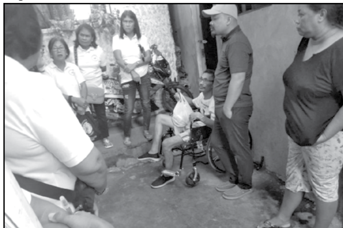
Distributing food packs to the elderly residents of Bgy. Wawa.