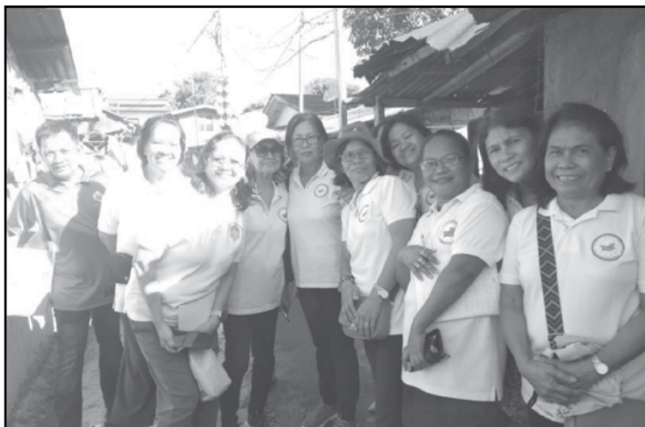
DMI sisters of Nstra. Sra. De la Paz y Buenviaje who participated in the outreach activity

The success of this activity was made possible through the generosity of the DMI sisters, parish volunteers and donors. Their collective efforts exemplified the mission of the DMI to serve with faith, hope and love.