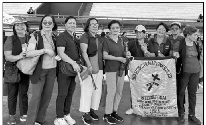
Delegation from the Daughters of Mary Immaculate International in the Marcha de la Mujeres.