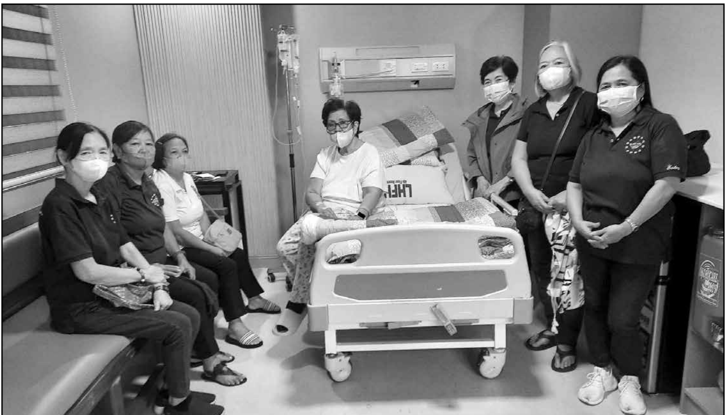
DMI sisters visit the sick to pray over and cheer them up.