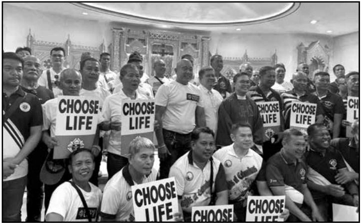
DMII and K of C members hold Choose Life placards during the Pro-Life Parade.