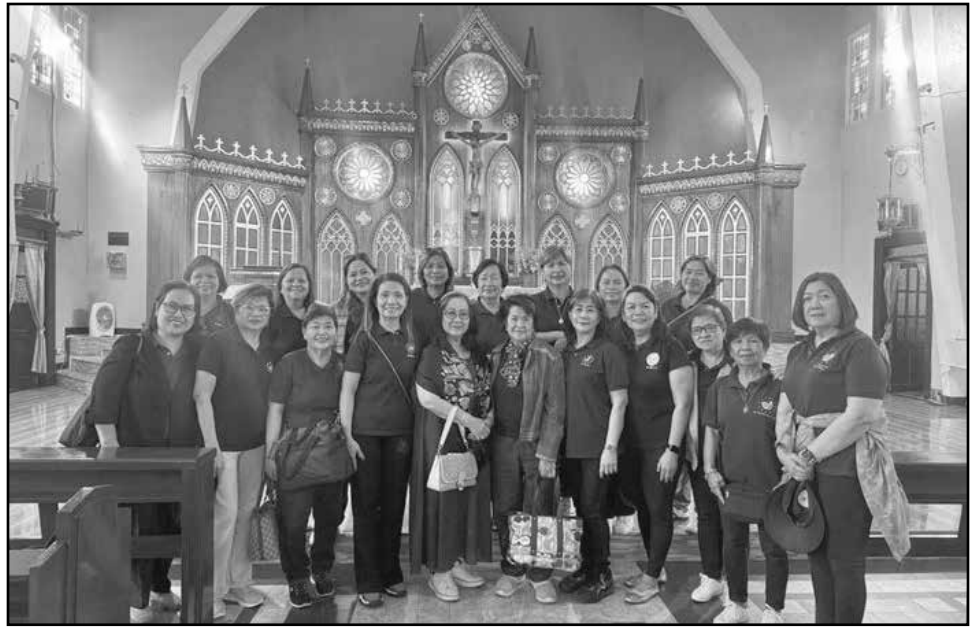
The conference participants.

On Day 2 of the conference, the Diocesan Mission Chairpersons presented their annual plan of activities to be implemented by the circles in the Diocese of Malolos.