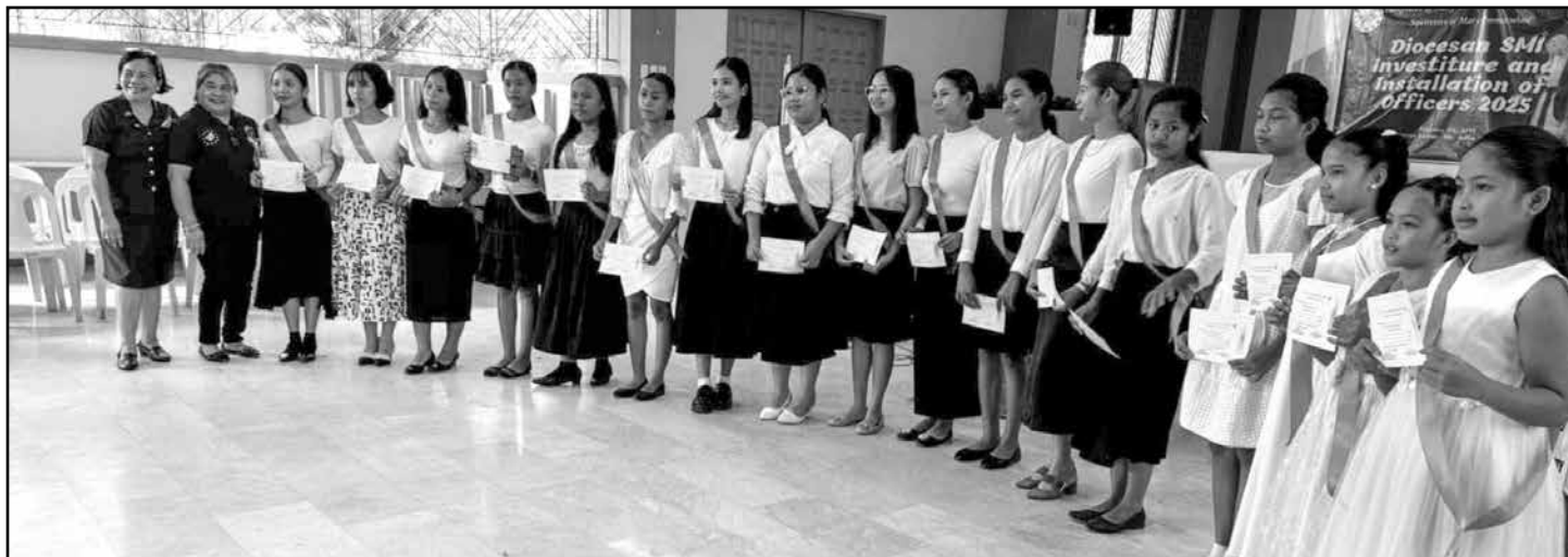
Newly invested Squirettes receive their pins and certificates of membership from the diocesan officers and lady counselors after the investiture ceremony.

The newly-installed SMI Diocesan Officers gave a briefing on the SMI organization and the duties of members after which the Lady Counselors pinned membership pins on the new SMIs. Tita DMIs were present to lend their support.