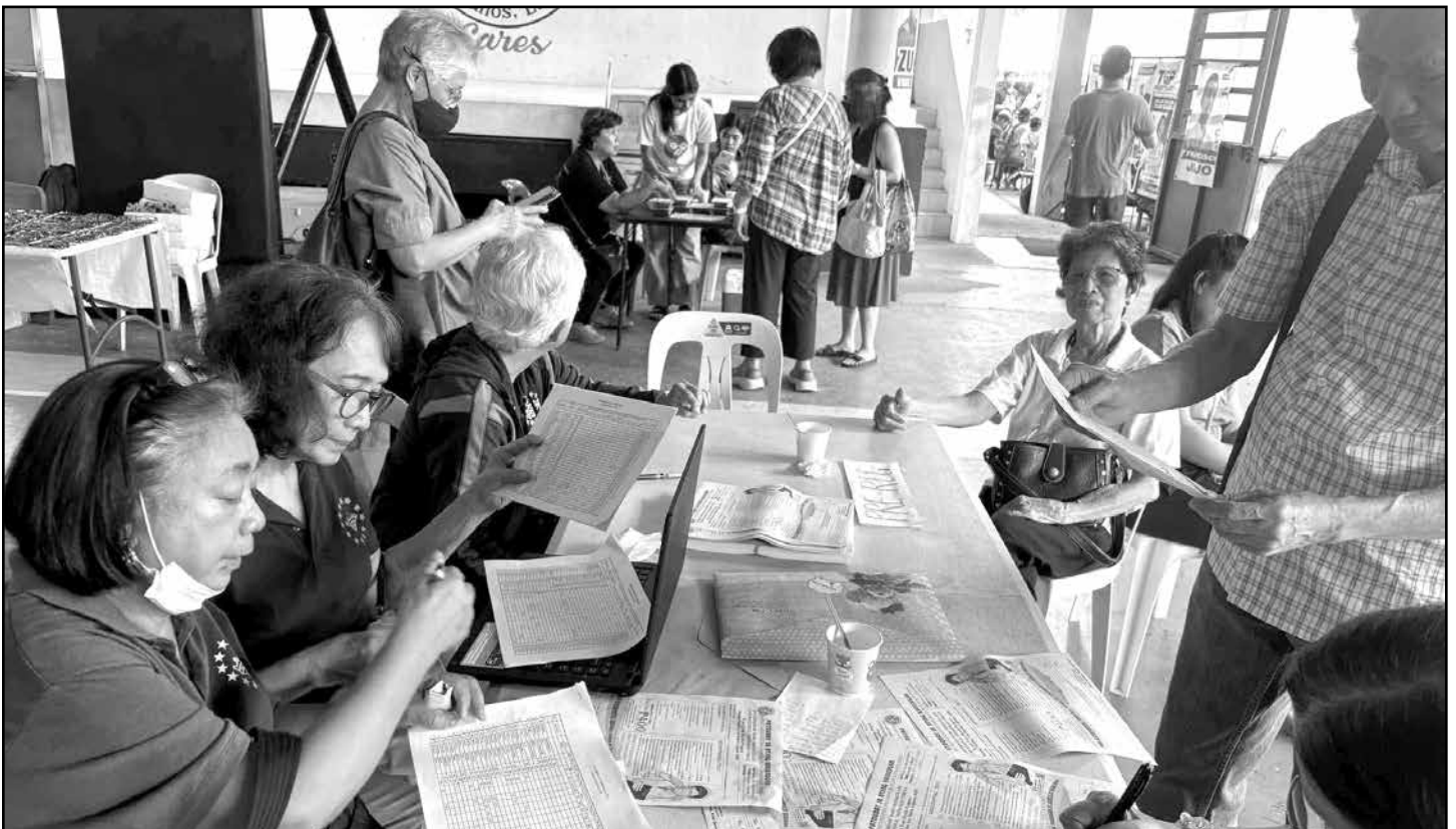
DMI sisters assist health volunteers during the activity.

Moreover, the 'Watch Your Health' initiative is just one of the many ways the Theresian Circle and other DMII circles all over the country manifest their commitment to Christian service and a testament to their unwavering dedication to create a significant impact on society through small acts of kindness that are done collectively.