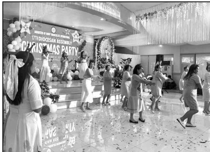
A dance presentation

Games, raffle prizes and exchange gifts enabled everyone to imbibe the Christmas spirit and to feel the joy of giving and sharing.