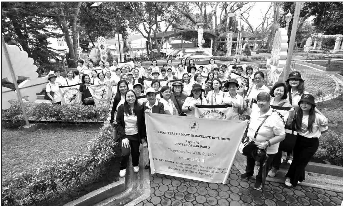
Participants in the Walk for Life

After the Mass, the Walk participants came away inspired carrying with them a renewed commitment to uphold the dignity of every human being.