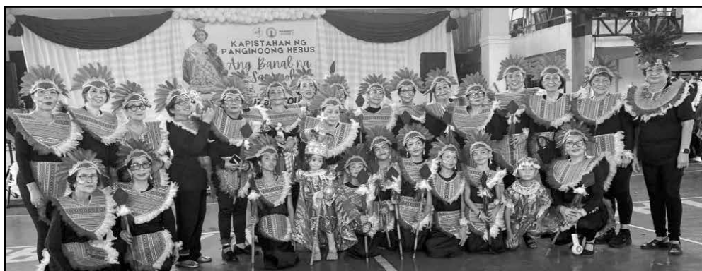
Sto. Nino festival at Sacred Heart of Jesus Parish