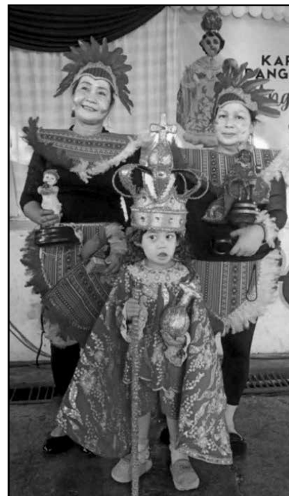
Sto. Nino look-alike contest