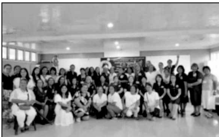
The officers and members of the Our Lady of the Immaculate Conception Circle with the Region XII officers.

The Diocese of Butuan donated a 4-foot image of the Immaculate Conception to each of the three new circles.